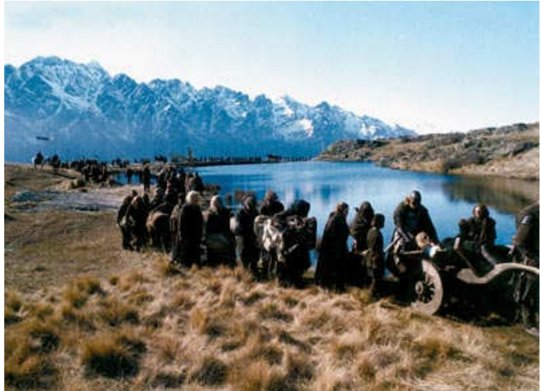
The refugees escape from Rohan

The front and inside covers of Ian Brodie's best selling Lord of the Rings Location Guidebook uses images from the top of The Deer Park.