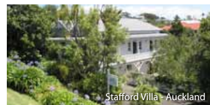
Stafford Villa - Auckland

Travel aboard the world renowned TranzAlpine Train, across the Canterbury Plains to the mountains, where Arthur's Pass and the Otira Tunnel lead to the West Coast. On arrival into Greymouth collect your rental car. Continue south along the narrow, bush clad, coastal plain. Stay 2 nights at the luxurious Te Weheka Inn, Fox Glacier.